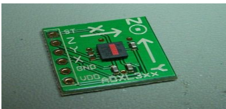
Fig.4. Adxl3xx Accelerometer

Three axis acceleration sensing device provides analog voltages on three axis X, Y, Z which are proportional to the accelerations [4]. As the device generates analog voltage, it is interfaced to the analog portA of PIC16F877A. X, Y, Z pins of the ADXL320 are connected to the AN2, AN1 and AN0 of PIC16F877A. The micro controller forwards the analog voltages to the A to D converter on three different channels, which converts the analog signal into 10-digit number. The sensor is a polysilicon surface micro machined structure built on top of a silicon wafer. Polysilicon springs suspend the structure over the surface of the wafer and provide a resistance against acceleration forces. Deflection of the structure is measured using a differential capacitor that consists of independent fixed plates and plates attached to the moving mass.