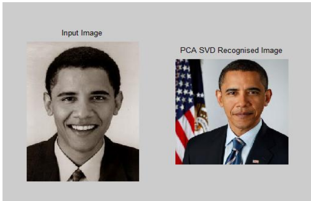
Fig 4:- Face Reorganization by PCA +SVD

Figure 3 is showing the output of the Accuracy. As we can see from the figure 3 the accuracy of the PCA+SVD is high as compare to PCA. Green color graph is showing the Accuracy for the PCA while Black color is showing the accuracy for the PCA+SVD based face reorganization.