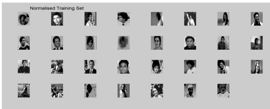
Fig 3:- Normalize Training Set

Normalize Training set is showing in the figure 3. Figure 3 is showing the generated normalize training set for given input.