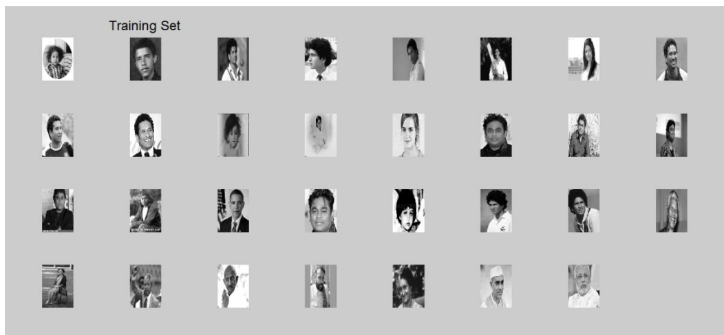
Fig 2:- Generate Training Set

For implement the Face Reorganization, we give the input image that, perform from the training set and then implement into normalize Training set. Figure 6 1is showing the Normalize Training set for the given input.