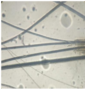
Mites observed from trichogram sample (under 10X magnification)