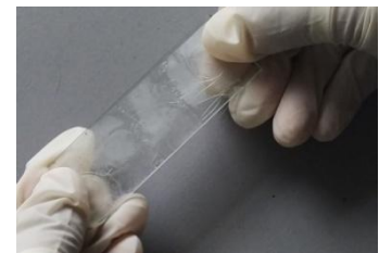
plate 1c. Tape impression smear