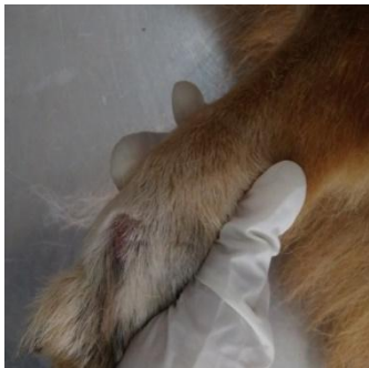
Plate 1b. hair pluck method