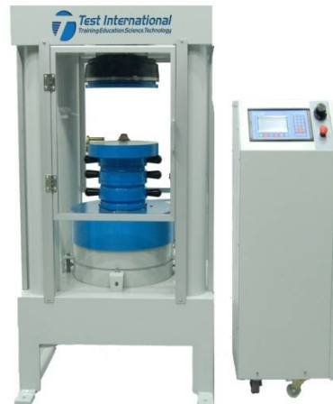
Fig -2: Compressive Testing Machine(CTM)