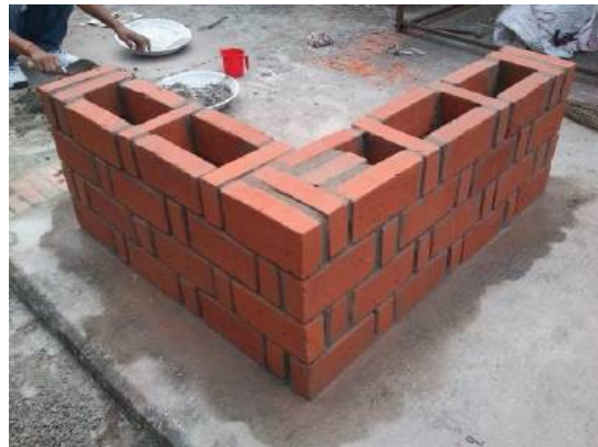
Figure1. Rat trap bond mechanism