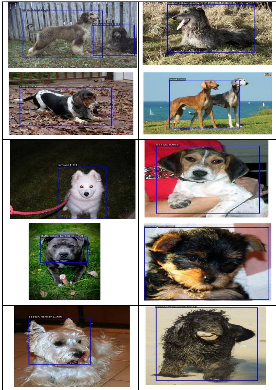
Fig 4: Examples of Scottish deerhound, afghan hound, basset, Saluki, Samoyed, beagle, Staffordshire bullterrier, Yorkshire terrier, scotch terrier and Cocker spaniel

In here we show dog examples in our tests