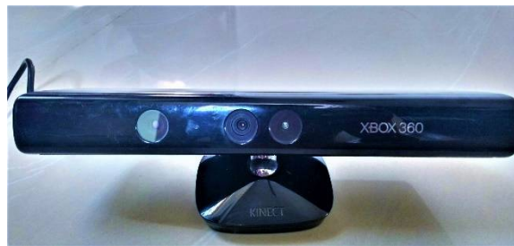
Fig.1. Xbox 360's Kinect sensor