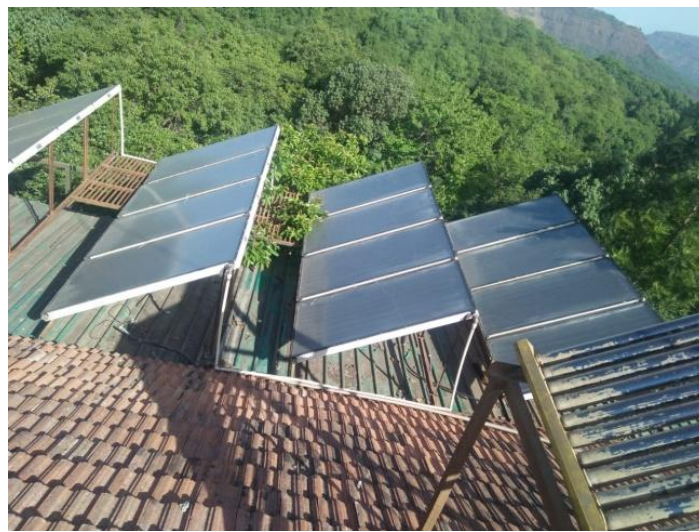
Figure 3. Photovoltaic (Solar) Cells

renewable energy, particularly in homes, offices and industries, for the purpose of lighting, heating and powering of appliances. In most rural and sub-urban regions in Nigeria, inhabitants do not have access to electricity supply. Where the Electrical energy is available, it is not reliable; hence inhabitants resort to other forms of energy such as wood, paraffin, and diesel generators, which pollute the environment and cause harm to man and plants.