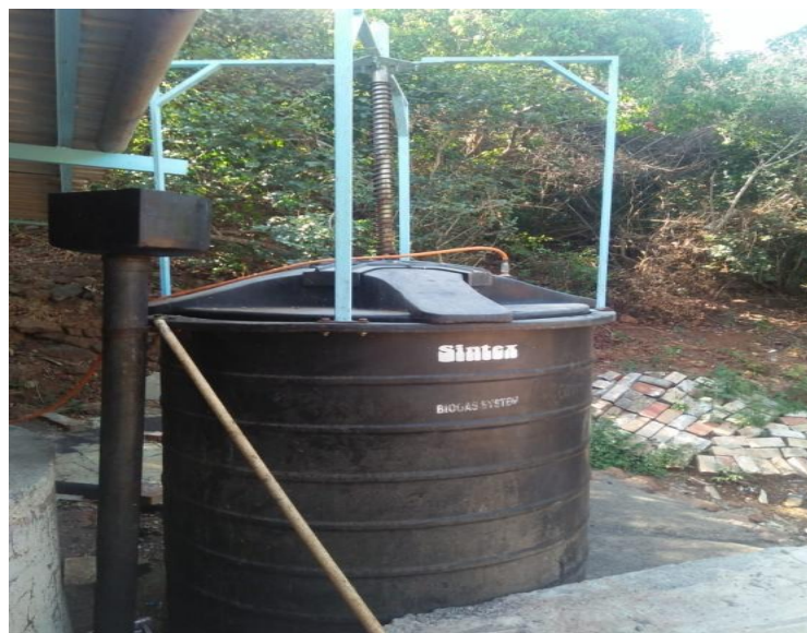
Figure1. Bio Gas Plant at Gourish Mahableshtar