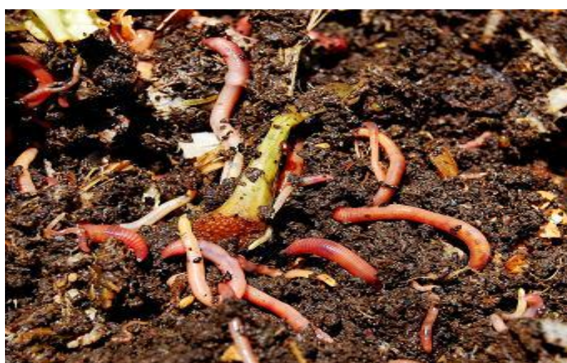
Figure 2: Vermi Composting