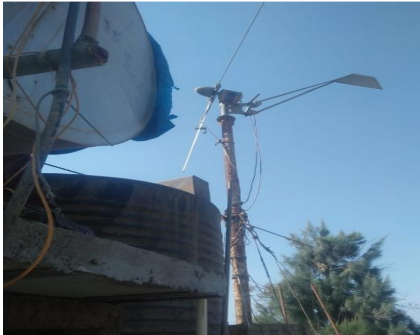
Figure 4. Wind Turbine Energy

increased demand for electricity to provide modern guest comforts and services. The energy management in hotels is the practice of controlling the consumption of electricity required for the delivery of products and services to customers. The power utilization can be lowered by adapting strategies such as change of organizational practice with low or no cost; implementation of energy efficient technologies that require capital investment; and encouraging guest to consume low power in all their activities in hotel building towards supporting the efforts of hotel in minimizing their GHG emissions ( Gourish Mahableshwar ). The energy efficiency is able to elevate the level of service of the hotel by lowering its energy consumption and cost of operation. Small wind energy systems are based on a rotor, a generator or alternator mounted on a frame, a tail (usually), a tower, wiring, and the electrical components: controllers, inverters, and/or batteries.