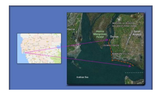
Fig: 1 Google satellite image of Gavier lake, Surat district, Gujarat

This study area covers approx. 8 km along the sea and is highly affected by high and low tide variation which directly influence avifaunal population in particular area. Human disturbance on the beach is major problem because of popularity of holistic place. Mangroves plantation provides best habitat for many aquatic species. Local people of surrounding villages are called "Macchhimar community" depends on coastal area for fishing.