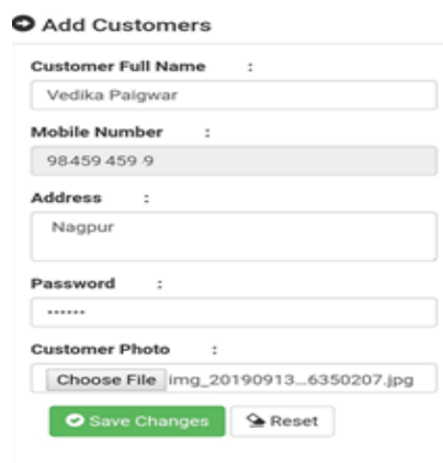
Fig.3 Screenshot of Add Customers Page

The figure is a screenshot which shows the registered customers by the shopkeeper in the system. The shopkeeper can view the details of customers and can block the account of the customer. The customers are divided into two fields the first field contains customers whose account is active and the second field contains customers whose account is blocked by the shopkeeper.