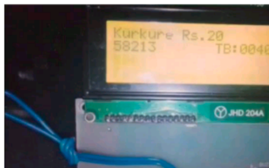
Fig. 3 Scanned product details on LCD

The product detail consists of product name, price, product id and total bill amount.