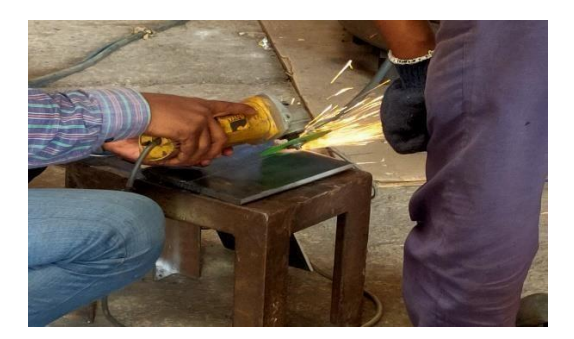
STEP 3: Edge preparation is done in sample material. The sample material choosen is carbon steel of grade the grinding process is to be done for the purpose of receiving the material to engrave g the purpose