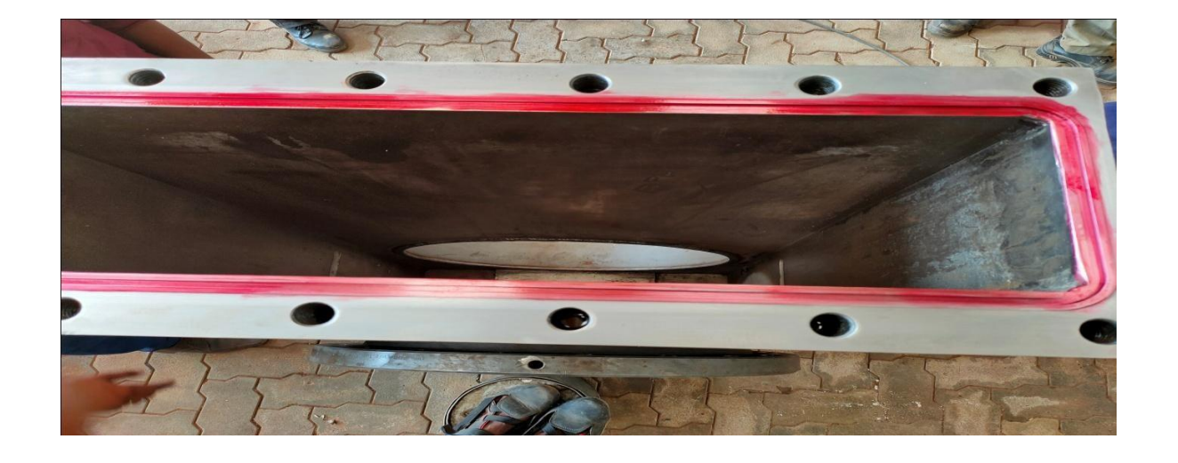
STEP 2 : Then the fault location in the gate valve are identification. This valve is identified from the part number and purchase number to engrave in the material is easy to picking the material

| e-ISSN: 2319-8753, p-ISSN: 2320-6710| <u>www.ijirset.com</u> | Impact Factor: 7.089| ||Volume 9, Issue 4, April 2020||