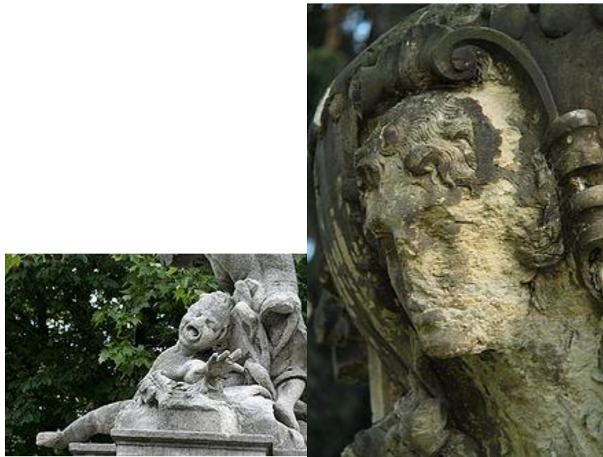
Figure 1: Deterioration of Monuments

Actually, areas subject to runoff are thinned out in marble monuments. Considering the passage indicated above, sulfation is hardly present. When outflow is prevented, sulfation is at its greatest. Therefore, you must conclude that: (i) a significant part of the sulfur compounds deposited by dry acid rains are not enough to affect the stone are deposition processes and the air; (ii) the main action of is to thin the stone, but only acid rain to explain the formation of one of the worst types of stone deterioration: the formation of well-known black crusts, essentially composed of gypsum crystals and soot particles. The role of chemicals has been extensively studied since the first issue. However, many problems remain unsolved. It could be assumed that both Sulfur dioxide and acid rain are partially responsible for the deterioration of the stone, but to what extent is not easy to say.