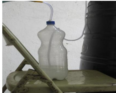
PLATE 2: SCRUBBER USED TO PURIFY BIOGAS