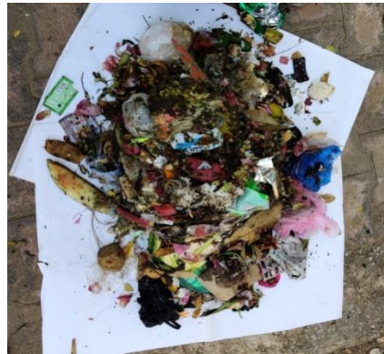
Plate 1: Kitchen Waste Sample

Different Volume of containers used between 5 liters to 20 liters to store the kitchen wet-waste, cooked-stale food, milk-waste-products with tight lids. Kitchen vegetables-waste such as peel-off, rotten-potatoes and leaves of coriander are segregated in different polythene covers of different size. The handling these containers should be carrying out with optimum safety and used hands protections.