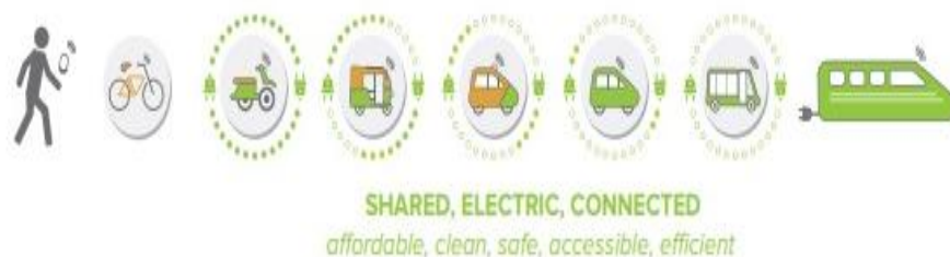
Fig.2. Mobility Paradigm, NITI Aayog Report, 2017

The road to futuristic city may sound as a fancy but it needs to be more grounded in dense Indian cities. Where one solution fits all cities cannot be adopted. The change has to be brought by improving the already existing infrastructure. To start with the multi modal integration and shared network, one has to start with the already available mode of transportation. Connected means all these modes can be accessed from the same place and same digital platform. The term ‘Asymmetric trips’ given by Martin Cooper in 2017, denotes a trip which is comprised of multiple modes of transport. The fragmented journey may sound opposite of seamless mobility , but, in dense developing cities this model of shared mobility and decentralized system will help to solve the problem of congestion and pollution and also the first and last mile connectivity