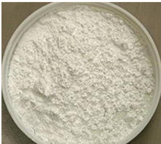
Fig. 1. Marble Dust Powder