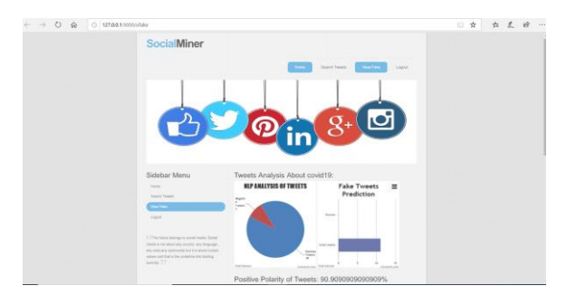
Fig 2. Fake News Detection

In proposed system we have created one web-based application using Python's Flask framework which is light weight. In proposed application we are fetching real time tweets from twitter data and applying algorithm on them to get result out of that. To access data from twitter, you need to have authenticate twitter developer account which allows you to access the data. After accessing the data, we are also storing that data into SQL database. Then we applied algorithms on that data. For sentiment analysis, we are using TextBlob and NLTK libraries. And for fake news detection, we have used TFIDF algorithm. It's taking approximately two to five minutes for execution. According to network complexity it fetches tweets from server and process them. Following screenshot shows the final output of project which has interpreted COVID19 keyword on twitter and which is accurate and efficient.