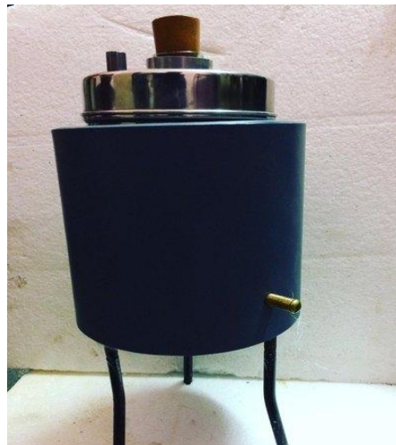
Fig 2: Apparatus used

From the graph we see that biodiesel sample 1 has the lowest pour point and cloud point. A four stroke diesel engine works by intake, compression, power and exhaust. Hence the Biodiesel sample 1 will be most useful for the present study. Various samples of Biodiesel were used with different additives.