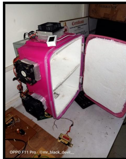
Fig.3 Experimental set up Fig. a Actual model of experimental set up