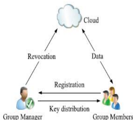
Fig. 1. System model

We consider a cloud computing architecture by combining with an example that a company uses a cloud to enable its staffs in the same group or department to share files. The system model consists of three different entities: the cloud, a group manager (i.e., the company manager), and a large number of group members (i.e., the staffs) as illustrated in Fig. 1.