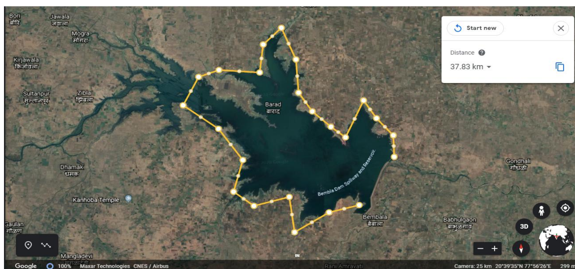
Bembla Dam -shows 23 birding spots which covers 37.83 km area.

The study was undertaken in Bembla spillway and Reservoir located on the bank of the river Bembla river in Yavatmal district, Maharashtra state, India. Bembla western part between 20.60^{\circ}\text{N} latitude and 78.12^{\circ}\text{E} and the eastern part between 20.61^{\circ}\text{N} latitude to 78.12^{\circ}\text{E} longitude. Reservoir covers an area of 53000 hectares which was given a big opportunities to an Ornithologist who use to visit the area for his study and research on birds. The Bembla dam is surrounded by village Koli in north, SH 15 in east and open agriculture land in west and Pahur at south direction. Study area including 23 stations and total 37.83 km area surveyed for diversity of birds. (Fig-1) The bird species survey was conducted every fourth day in early morning from 6.00 am to 9.30 am and on every Saturday and Sunday from 6.30 am to 10.30 am. The species of birds were observed by using . Binocular Nikon 10*50 X, was used for close observation of birds and for photography Nikon D7500 camera, with Lens 200-500 mm. Book of Indian Birds by Salim Ali and Birds of the Indian Subcontinent by Grimmett, Inskipp and Inskipp were used as field guides and for preparing check list.