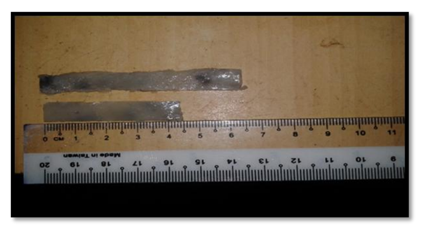
Figure 2: Elongation test on biodegradable plastic