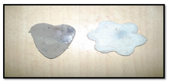
Figure 3: Biodegradable plastic mould

Figure 3 shows the biodegradable plastic mould. Moulding is the process of manufacturing by shaping liquid or pliable raw material using a rigid frame called a mould or matrix. This it may have been made using a pattern or model of the final object. Moulding is the process of forcing melted plastic in to a mould cavity. Once the plastic has cooled, the part can be ejected. As the figure 3 showing the biodegradable plastic that has been made is mouldable into various shape. Therefore, biodegradable plastic that have been made is a conventional plastic where it can replace the petroleum based plastic that is most popular amount the plastic moulding.