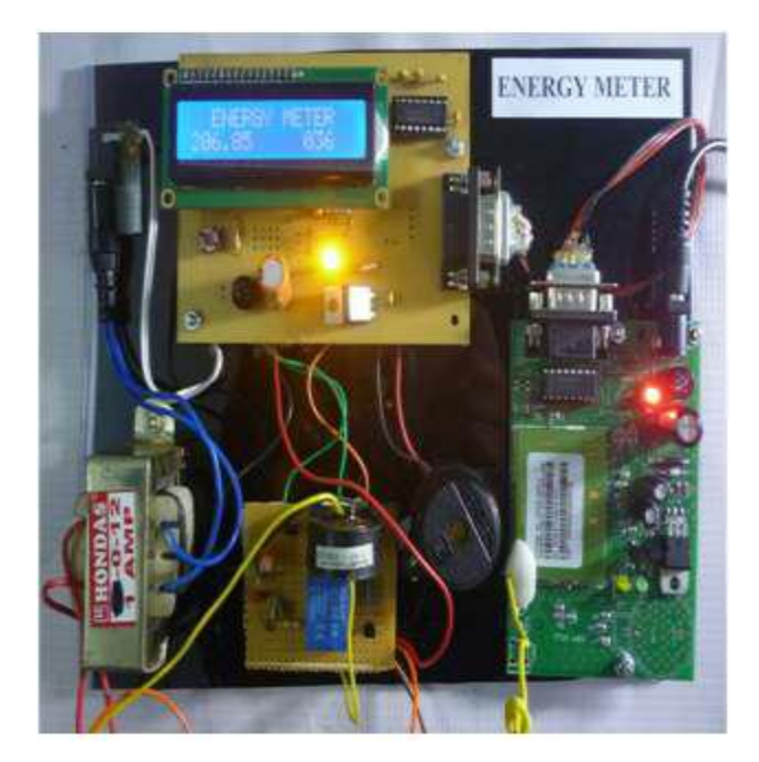
Fig.3 Hardware of energy meter

A buzzer or beeper is an audio signaling device, which may be mechanical, electromechanical, or piezoelectric. Typical uses of buzzers and beepers include alarm devices, timers and confirmation of user input such as a mouse click or keystroke. It is used for beep an alarm during overload.