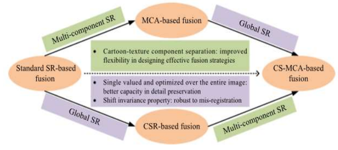
Fig. 1 Proposed System

DUE to the diversity of image capture mechanisms, medical images may reflect different categories of knowledge about organs / tissues. For example, the computed tomography (CT) images will clearly show dense structures such as bones and implants, while the soft tissue magnetic resonance (MR) images provide anatomical details of high resolution. The goal of the pixel-level medical image fusion technique is to combine the complementary information in multi-modal medical images by producing a composite image that is hoped to be more appropriate for physician observation or machine perception. During the last few decades a number of imaging fusion approaches have been proposed. These methods can generally be divided into four groups based on the accepted technique of image transformation: methods based on multi-scale decomposition (MSD), methods based on sparse representation (SR) conducted in other fields and methods based on the combination of different transforms. In this paper we concentrate above all on SR-based image fusion.