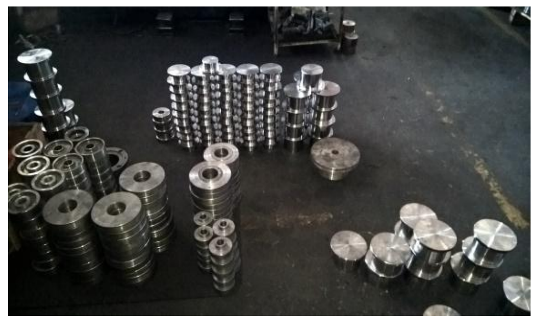
Fig.4 Jobs Placed as per order