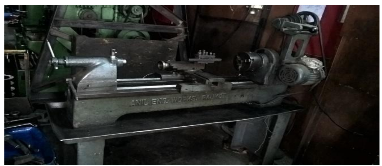
Fig.5 location of Lathe in lighting clean area

The third S is stresses on cleanliness because it ensures a more comfortable and safer workplace, as well as better visibility, which reduces retrieval time and ensures higher quality work, product or service. All equipment malfunction or defects must be fixed or reconditioned. The key word in this description is keeping the workplace and everything in it clean and in good functional condition. This is achieved through the combination of the cleaning function and defect detection.