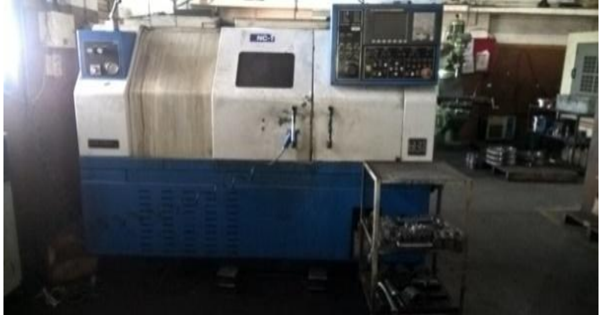
Fig.6 location of CNC in lighting clean area