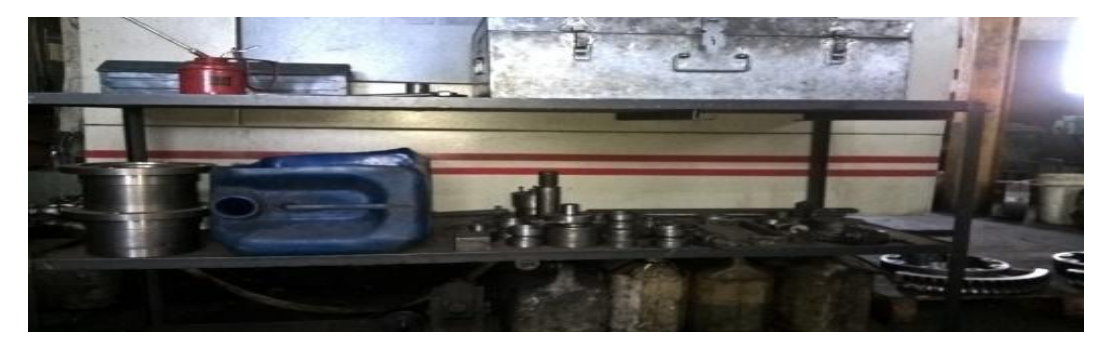
Fig.2Tool Storage Set in Order

(A High Impact Factor, Monthly, Peer Reviewed Journal) Visit: <u>www.ijirset.com</u> Vol. 9, Issue 3, March 2020