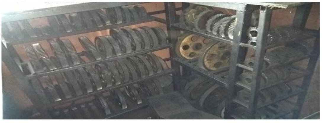
Fig.3 Jobs Store in Racks