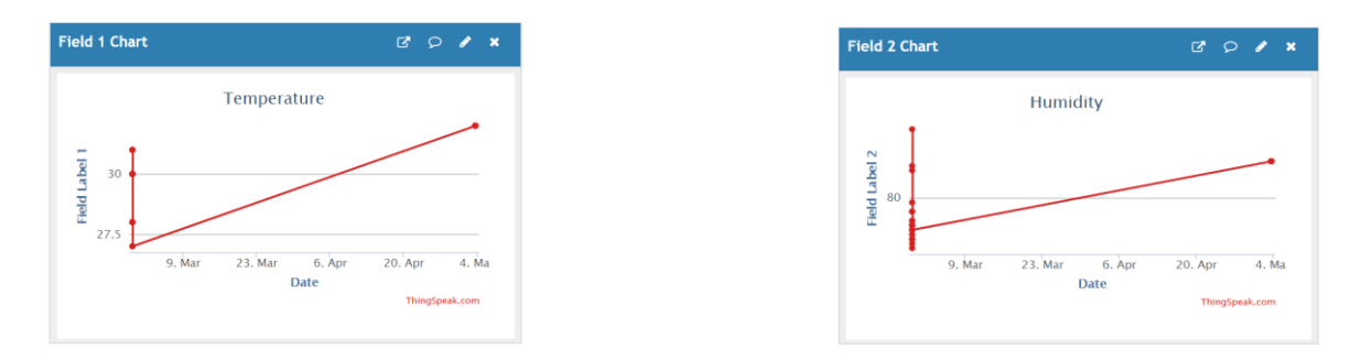
fig (2): Temperature and Humidity values stored in the cloud.

The figure shows the value stored in the cloud and the various depictions for the values to be utilized.