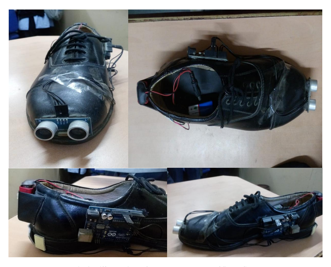
Fig. 3: Different views of the Developed Model of Smart Shoe

The above-shown pictures are the pictorial representation of the developed model. Here the shoe is designed or arranged in such a manner so that it can handle all the required things to work as a helping aid. Smart shoes would be providing a hearing sensation to the person. Wearing this shoe will inform them about the obstacle and provide them with a secure way to the destination. Technology helps the blind people to communicate with the environment. The communication process and the dissemination of information has become very fast. The application results enhance the understanding of the problems facing blind people daily and may help encourage more works targeted to help blind people to live independently in their daily lives. The smart shoes for the blind person will help to reach the destination with the whole navigation system provided in the shoes which will inform the blind person through an earphone.