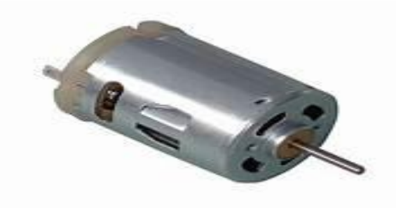
Fig.5 DC motor

Department of ECE, Adhiyamaan College of Engineering, Hosur, Tamilnadu, India