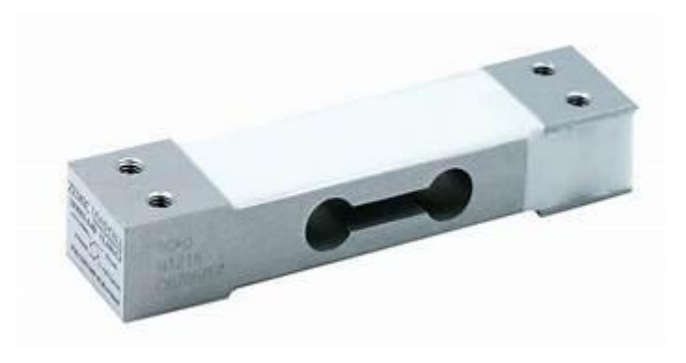
Fig.3 load cell

measures the load at the door steps of the vehicle. If any kind of load is detected for the certain interval of time, the signal is given as the input to the Arduino and alerts the user about it and automatically changes the state of the motor to OFF condition.