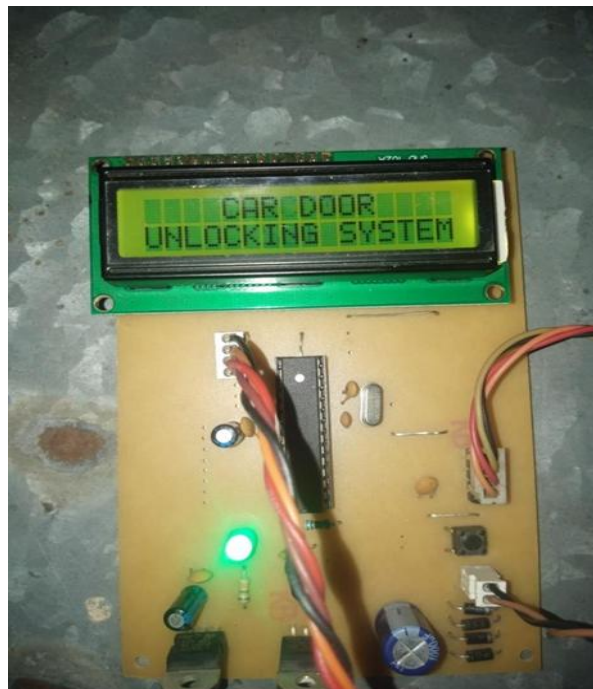
Fig 1.2- LCD Display

This proposed system will help, if we forgot our car keys inside the car, it can make helps to get our car keys back. This system is also provided security if small baby stuck in the car and the car gets locked and baby can't open the door then using this system, we will take out the baby safely outside the car.