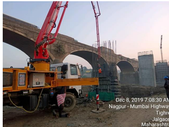
Figure 1: Concrete pump, Ayush Procon Pvt. Ltd. Nagpur- Mumbai Highway, Tighre, Jalgaon