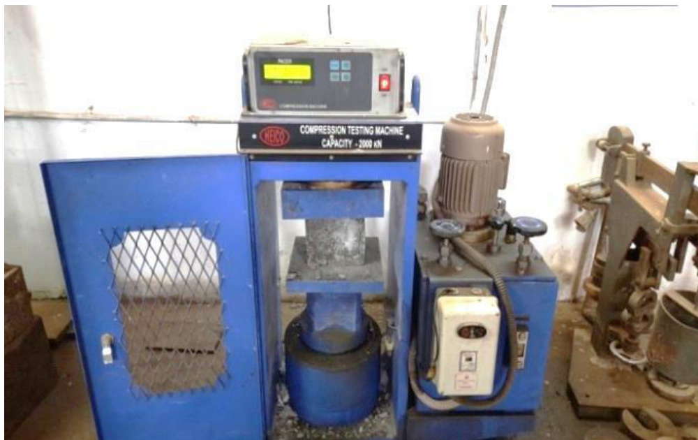
Figure 1: Compression testing machine