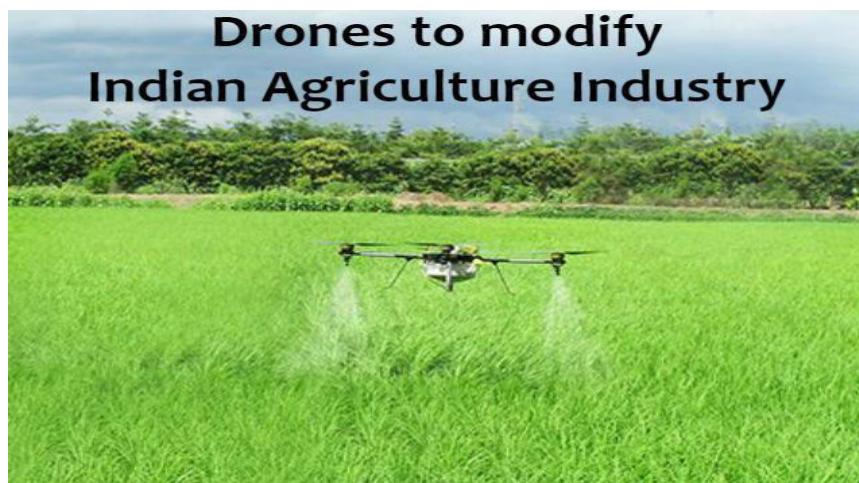
Figure 2: Modern tool usage in Farming

The modern tools are very much essential in developing countries like India. The farming has to grow technically then only people can see reduction in cost of the farm produces what they buy. By which both Farmer and Customer will be happy.