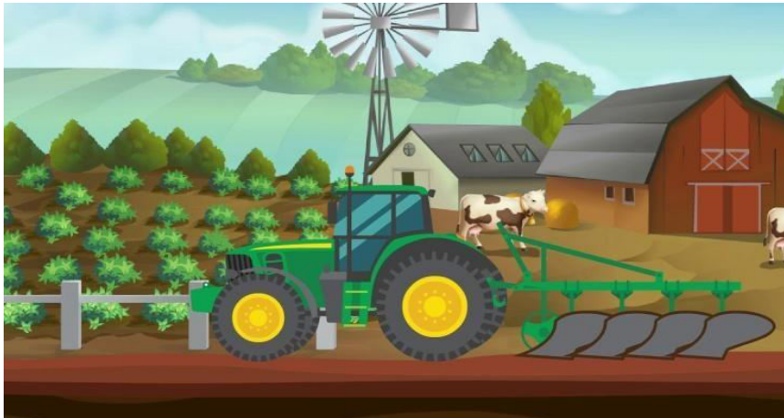
Figure 3: Animated Videos

To make farmers to understand modern farming with the help of animated videos and also demonstration of the live research happening will be showcased on this platform as shown in Fig3.