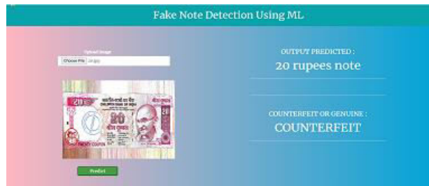
Figure 3: Detecting Fake note using Image dataset

Figure 2 tells about detecting the genuine note using the image dataset. To detect whether the currency is genuine here we have considered the parameters such as identification marks, latent image and security thread.