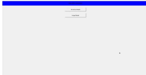
Figure 1: Entry Screen

Figure 1 describes about the entry screen. This screen contains two options i.e., Numerical dataset and Image dataset. When we click on the Numerical dataset option the currency is detected whether it's genuine or counterfeit using the variance, skewness, kurtosis and entropy values of the note and when we click on the Image dataset option the currency is detected whether it is genuine or counterfeit using dominant parts of image of currency note such as identification marks, latent image and security thread.