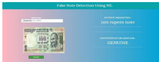
Figure 2: Detecting Genuine note using Image dataset

Figure 1 describes about the entry screen. This screen contains two options i.e., Numerical dataset and Image dataset. When we click on the Numerical dataset option the currency is detected whether it's genuine or counterfeit using the variance, skewness, kurtosis and entropy values of the note and when we click on the Image dataset option the currency is detected whether it is genuine or counterfeit using dominant parts of image of currency note such as identification marks, latent image and security thread.