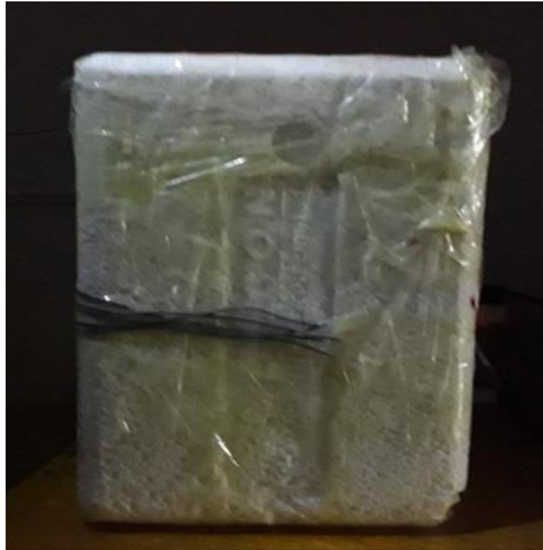
Fire extinguishing device

An activation or trigger strip is implanted into the ball's outer casing. It firmly holds the dry fire extinguishing agent inside. When the activator or trigger is exposed to flames for more than a few seconds, the casing will burst open and disperse a cloud of chemical powder in the surroundings.