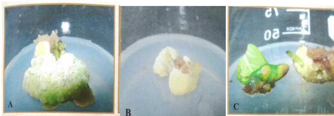
A: Callus Induction through nodal explant, B: Callus induction through internodal explant, C: Callus induction through leaf explant