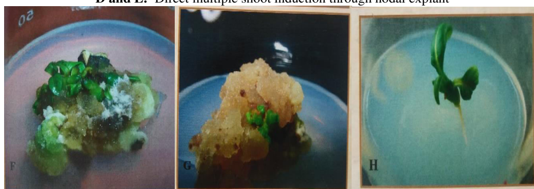
F and G: Indirect multiple shoot induction through nodal callus, H: Root induction.