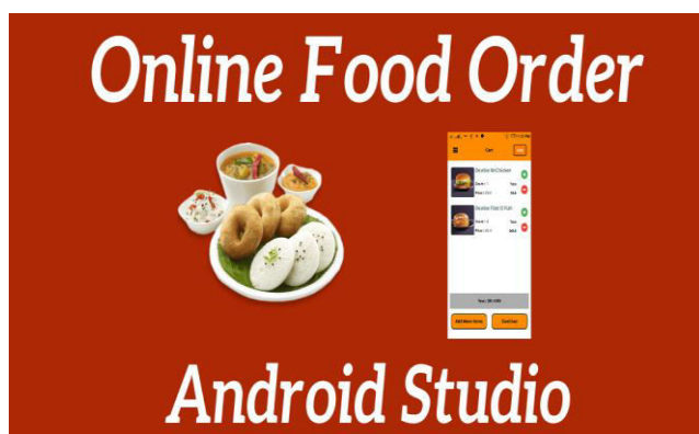
ONLINE FOOD ORDERING SYSTEM LOGO