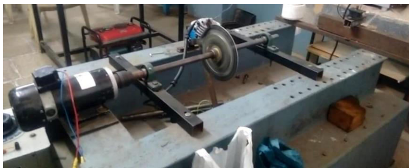
Fig. 1. CLD for brake sequel.

Accelerometer Atriaxial CCLD piezoelectric accelerometer (Deltron type 2524-B) with a sensitivity of 9.507 mV/g and a frequency range of 0.2 Hz to 12.8 kHz was employed in the current tests. It uses the piezoelectric action of various materials to quantify dynamic changes in mechanical variables (such as acceleration, vibration, and mechanical shock). The seismic mass loads the piezoelectric element when a physical force is given to the accelerometer, according to Newton's second law of motion. The change in electrostatic force or voltage produced by the piezoelectric material can be seen as a result of the force applied to it. Piezoelectric accelerometers, like all converters, convert one kind of energy into another and output an electrical signal in response to a quantity, property, or circumstance. Taking a broad approach. A voltage exists between the two plates of this capacitor. One of these plates works as a diaphragm in a condenser microphone and is composed of a very light material. When sound waves strike the diaphragm, it vibrates, changing the capacitance by changing the distance between the two plates. The capacitance increases and a charge current is generated as the plates are closer together. The capacitance is lowered and a discharge current is generated when the plates are separated further. For this to work, voltage must be applied to the capacitor. The microphone receives this voltage from a battery.