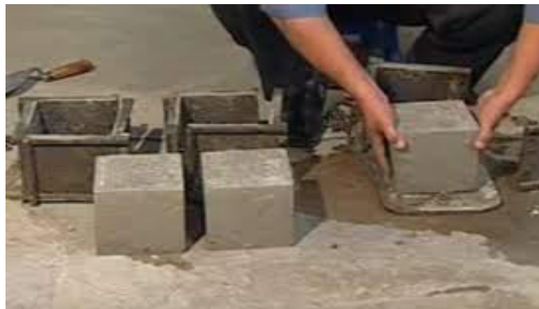
Fig 4. Casting Concrete cubes