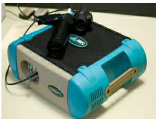
Fig 2. Spectroradiometer

spectral range. Modern day field spectroradiometers still cover the same wavelength region as their predecessors. However, the spectral resolution tends to be uniform; around 1nm over the whole bandwidth and the integration times have increased by about factor 10. As well, the use of portable field computers with some instruments facilitates their operation and the subsequent data transfer to other systems. Field spectroradiometers can be divided into two classes: single beam and dual beam instruments. Dual beam instruments are capable of measuring two energy sources simultaneously, i.e. incident energy and reflected energy can be recorded at the same time. This gives the dual beam instruments an advantage over single beam instruments, as the latter have to acquire these data consecutively, i.e. there is a time delay during which the incident energy level can change.