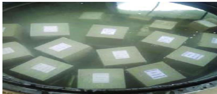
Fig .5.Curing of Concrete Cubes