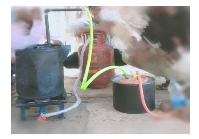
Figure 2: Experimental Setup

A laboratory scale externally heated fixed bed pyrolysis batch reactor was used for production of oil from plastic. The schematic diagram of plastic pyrolysis setup is shown in figure. Basic instruments of the pyrolysis chamber are temperature controller, condenser, a heating coil, storage tank, valve, and gas exit line. The effective length and diameter of the glass made reactor are 38 cm and 15 cm, respectively. The reactor with polythene was heated electrically up 475°C with Ni- Cr wire electric heater. Then the gases produced from heating of plastic are passed toward condenser, where condensation of these gases occur and get oil from the plastic. Mainly there are two types of plastics: thermoplastics and thermosetting plastic. If enough heat is supplied, thermoplastics can be softened and melted repeatedly. On cooling, they are hardened, so that they can be made into new plastics products. Examples are polyethylene terephthalate, polystyrene, polyvinyl chloride, high- density polyethylene, low-density polyethylene, poly propylene etc. They are recyclable. Thermosets or thermosetting plastics can be melted and shaped only once.