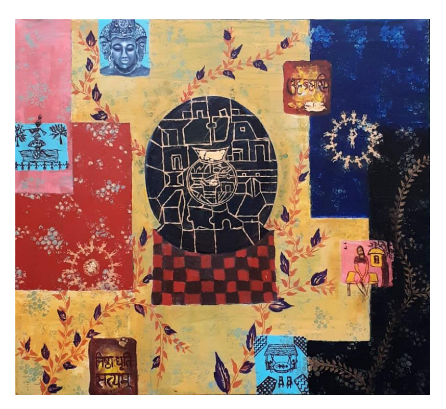
Confluence of traditional and contemporary art - 5

To understand the Indian art culture, first, let us know some aspects of its development - the contribution of the Mauryans in the development of art and architecture was commendable.