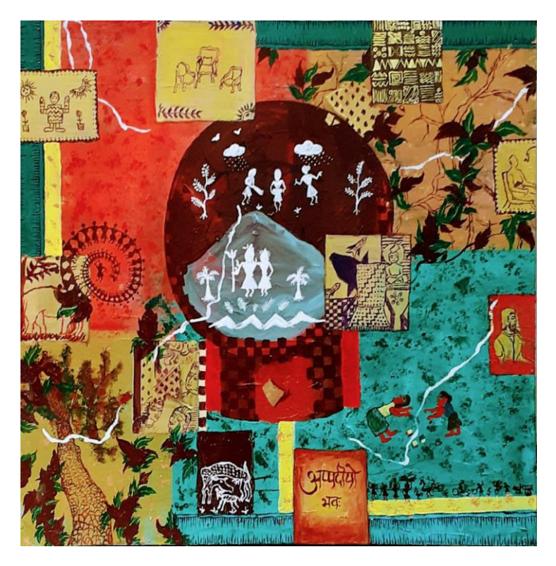
Confluence of traditional and contemporary art -3

These shifting strategies to engage the audience demonstrate how the importance of contemporary art exists beyond the object itself. Its meaning develops from a range of cultural discourse, interpretation and personal understanding, in addition to the formal and conceptual problems that previously inspired the artist.