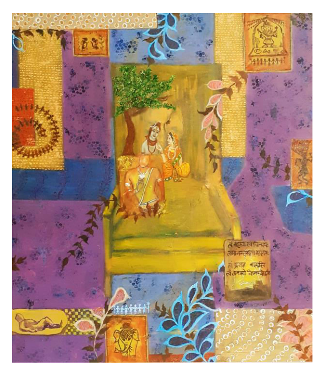
Confluence of traditional and contemporary art - 4

Picture composition is done by humans; it has always been associated with human development. The history of Indian art has been very deep and mysterious.