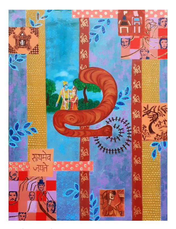
Confluence of traditional and contemporary art - 1

Tribal arts are a modified form of folk art and the traditional aesthetic sensibility and authenticity of folk art in India have great potential in the international market. Rural folk paintings of India have distinctive colourful designs, which are presented with religious and mystical motifs. Some of the most famous folk paintings of India are Madhubani painting of Bihar , Patachitra painting of Odisha state, Nirmal painting of Andhra Pradesh , and many other such folk art forms.