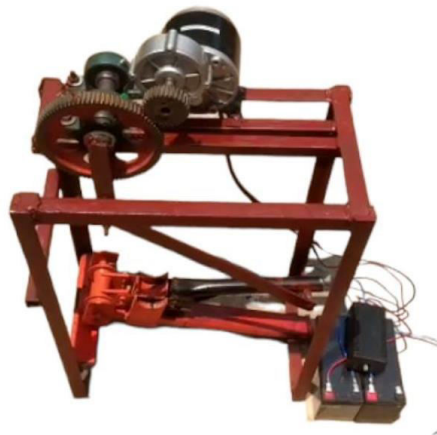
Fig. 2.Final Assembly of Sugarcane Bud Cutting Machine

The final result of this work is the fabrication and assembly of a semi-automated sugarcane bud cutting machine that can effectively reduce manual labour while increasing productivity and minimizing wastage during sugarcane farming operations. The outcome of the fabricated machine is to separate the buds from the sugarcane stalk. In the traditional way of plantation nearly 3 tons of sugarcane is used for plantation per Acre.