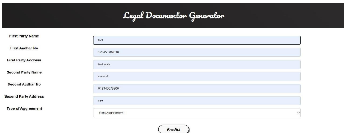
Fig3 Giving input to the system