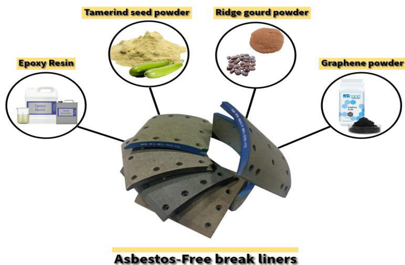
Fig 1: Asbestos free brake liner

In response to the increasing demand for environmentally friendly and safe braking solutions, this project embarks on the mechanical characterization and optimization of asbestos-free nanocomposite polymer-based brake liners. Traditionally, asbestos has been a key component in brake liners due to its heat resistance and frictional properties. However, environmental and health concerns have led to a significant shift towards developing alternative materials. This project focuses on leveraging advanced materials science and machine learning techniques to design and optimize brake liners that not only meet but exceed the performance standards of their asbestos-containing counterparts.