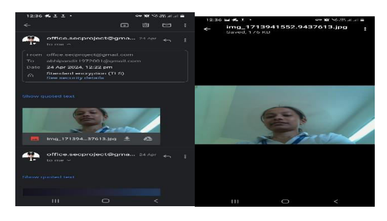
Fig.b. Movement Detected of Person 1