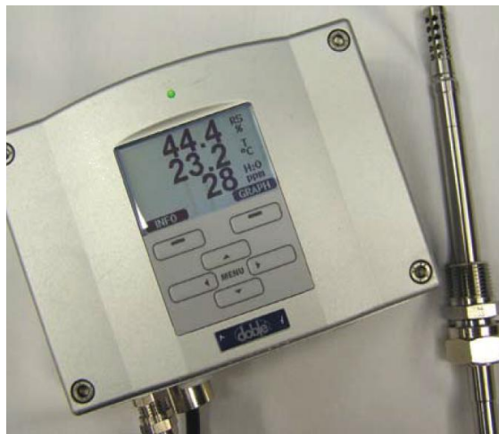
Fig 2. Doble Moisture-in-oil Sensor.

transformer's severe environmental conditions which include the top temperature 100°C and the hottest-spot temperature 145°C. Compared to the traditional humidity-sensitive materials such as acetate fibre, polyimide is a humidity-sensitive material which has a very good heat resistance. Polyimide has stable physical and chemical characteristic from -200°C to 400°C.