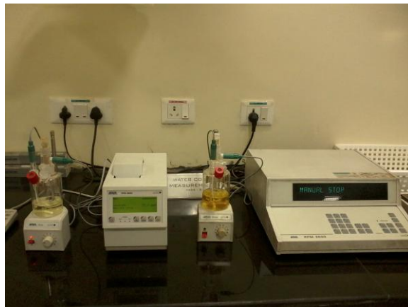
Fig 3. KFT Titration Test Setup