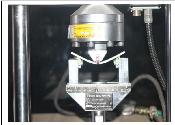
Fig.2: Picture Showing the Flexural Test Conducted on the test rig.