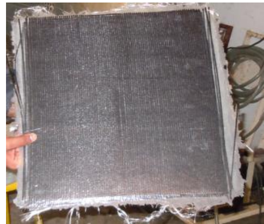
Fig. 1: Preparation of specimen using land layup