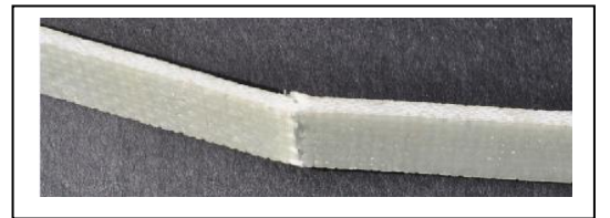
Fig 3: laminates after failure.