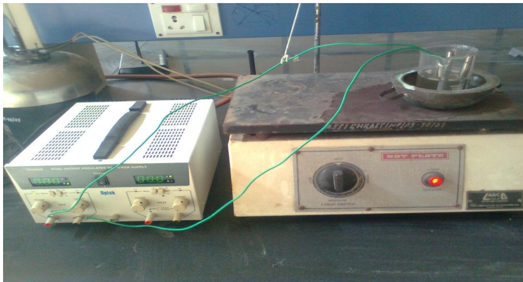
Figure 1 Experimental set up of ECP

The effects of electro polishing of work piece immersed in an electrolyte tank are shown in Figure 1. The SS202 stainless steel specimens with a fine finish of Ra \ 0.21\mu\text{m} are used as substrates. The testing of samples is carried out in a 1 liter capacity glass beaker, with an aqueous solution of Orthophosphoric acid, Sulphuric Acid and Water. The substrates are cathodically biased using a DC power supply with high (30 V) current capability. To investigate temperature effect on the electro polishing temperature of electrolyte is changed from 30\text{ }^\circ\text{C} to 100\text{ }^\circ\text{C} in steps of 4\text{ }^\circ\text{C} to 5\text{ }^\circ\text{C} increments.