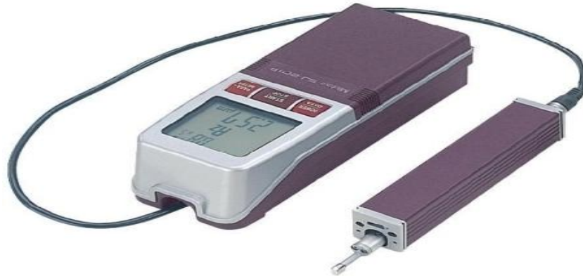
Figure 4. Surface Roughness Tester (MITUTOYO SJ-201)