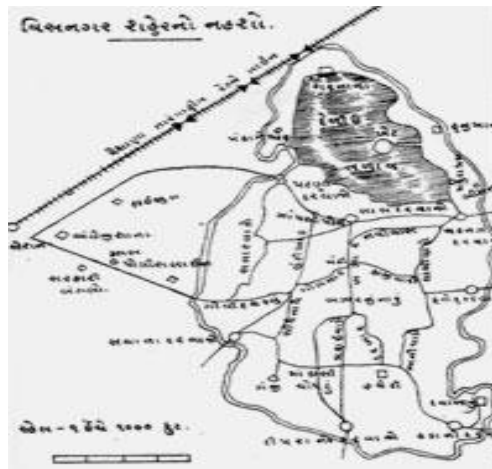
Maps showing Visnagar city area