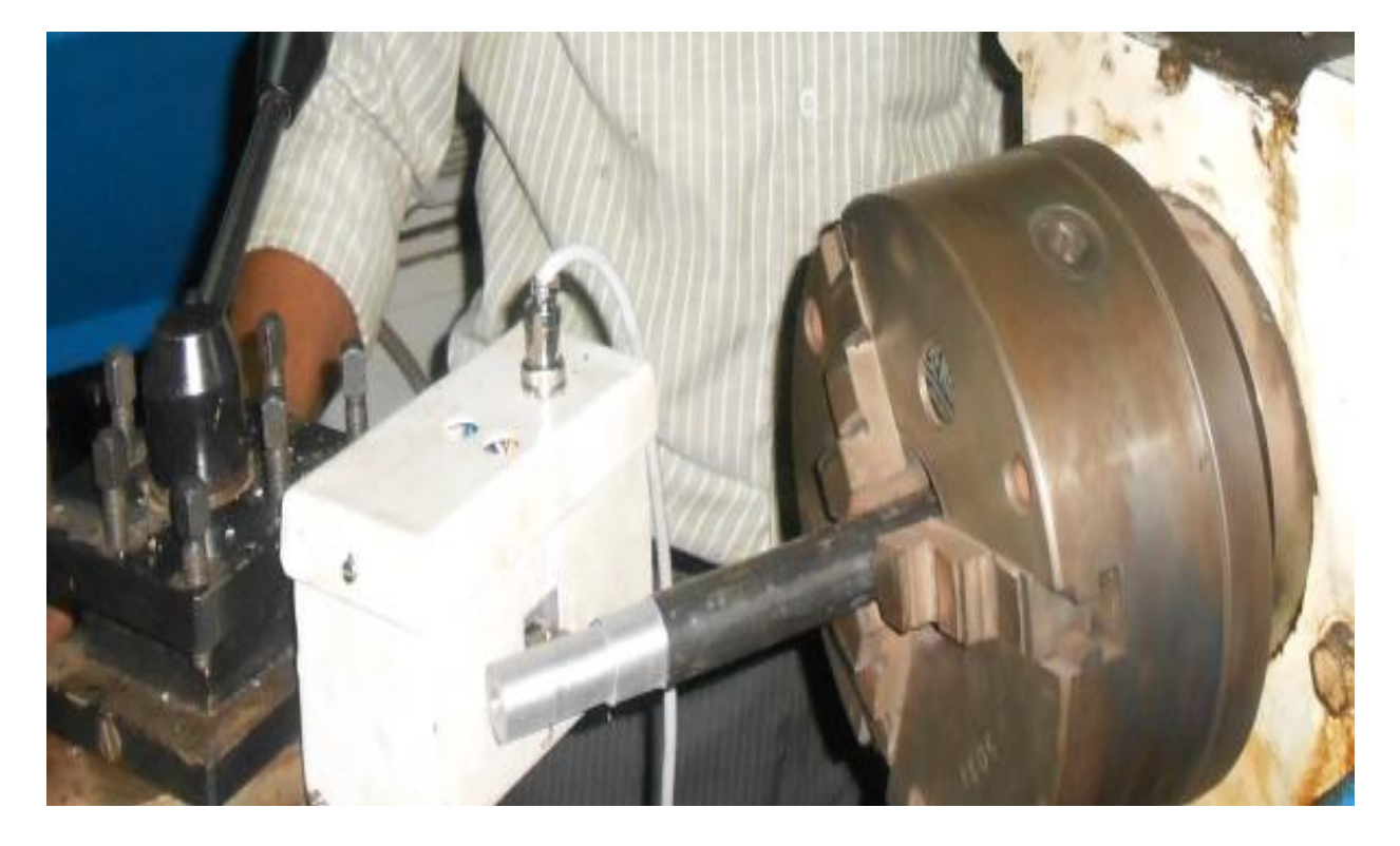
Fig. 1 Experimental setup

(An ISO 3297: 2007 Certified Organization) Vol. 2, Issue 12, December 2013