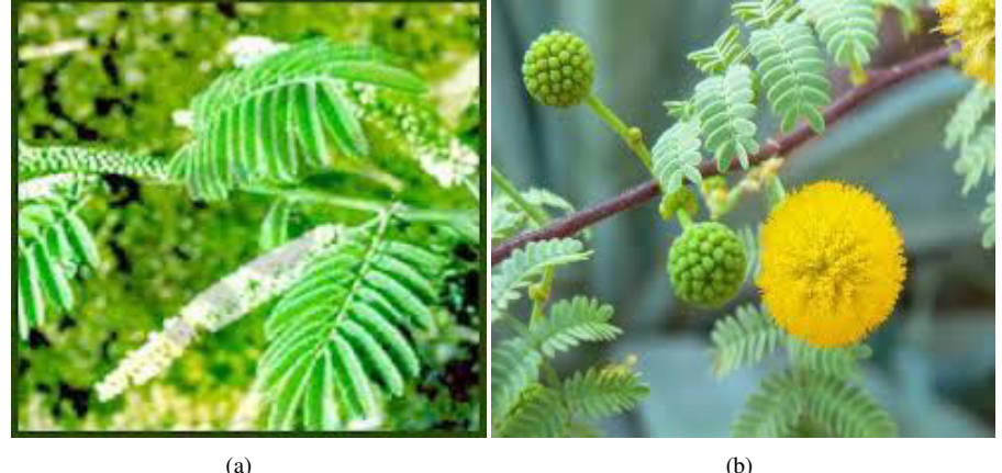
Fig. 10. Parts of plant Acacia Arabica (a) Leaves (b) Flowers.

Leaves – It is a twice compound they consist of 5-11 feather like pairs of pinnae and each pinna is further divided into 7-25 pairs of small, elliptic leaflets that can be bottle to bright green in colour and its stalks are heavy and contain very small gland almost no noticeable with the naked eye can be found at the base of most of the upper pinnae pairs.