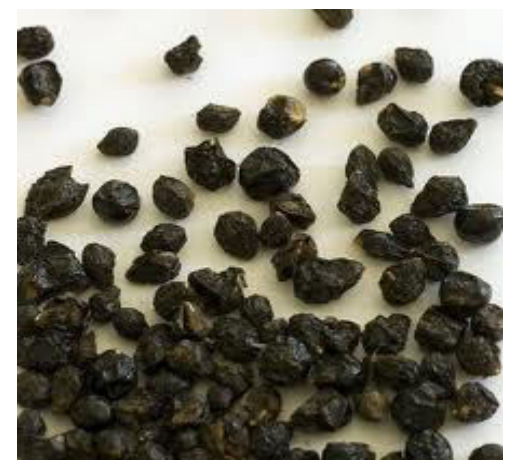
(a) Fig. 5. Part of plant Lantana camara (a) Seeds.

Seeds - Mature plants produce up to 12,000 seeds annually. Seed germination occurs when sufficient moisture is present. Germination is reduced by low light conditions. The root system is very strong with a main tap root and a mat of many shallow side roots.