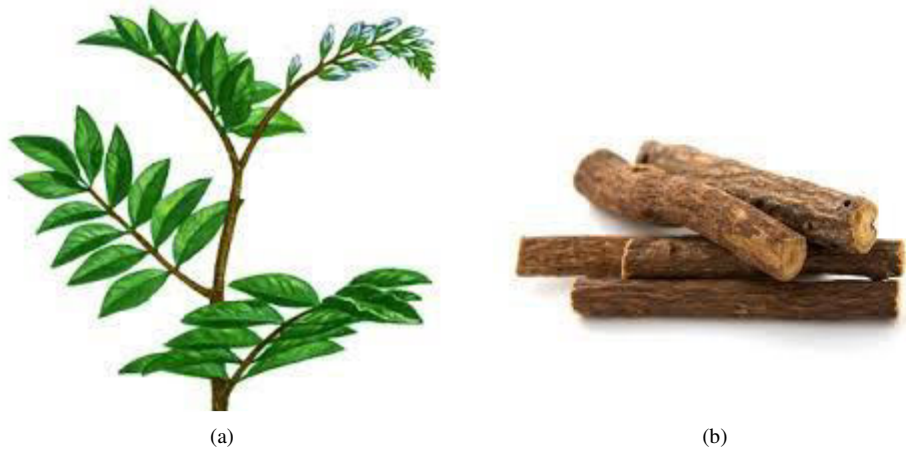
Fig. 6. Parts of plant Glycyrrhiza glabra (a) Leaves (b) Roots.

Leaves - It is a multi-foliate and impair pinnate.