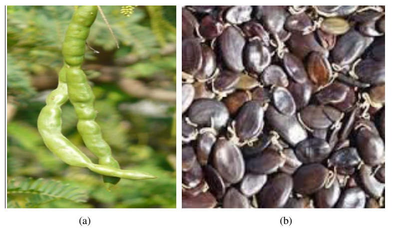
Fig. 11. Parts of plant Acacia Arabica (a) Fruits (b) Seeds.

(An ISO 3297: 2007 Certified Organization) Vol. 2, Issue 12, December 2013