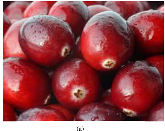
Fig. 8. Part of plant Vaccinium oxycoccos (a) Fruits.

Fruits- They are avoided with 5-1 hard angles curving up wards, glabrous with five to seven wings, woody and fibrous.