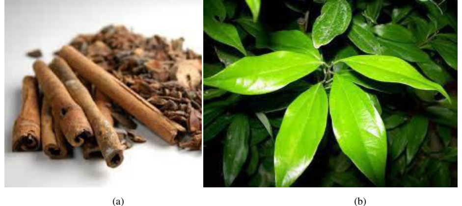
Fig. 9. Parts of plant Cinnamomum zeylanicum (a) Bark (b) Leaves.

Bark- The dried bark of the shoot of trees is deprived of cork and most of its cortex. The individual pieces of bark are not more than 0.5 mm thick and of a dull pale brown in colour.