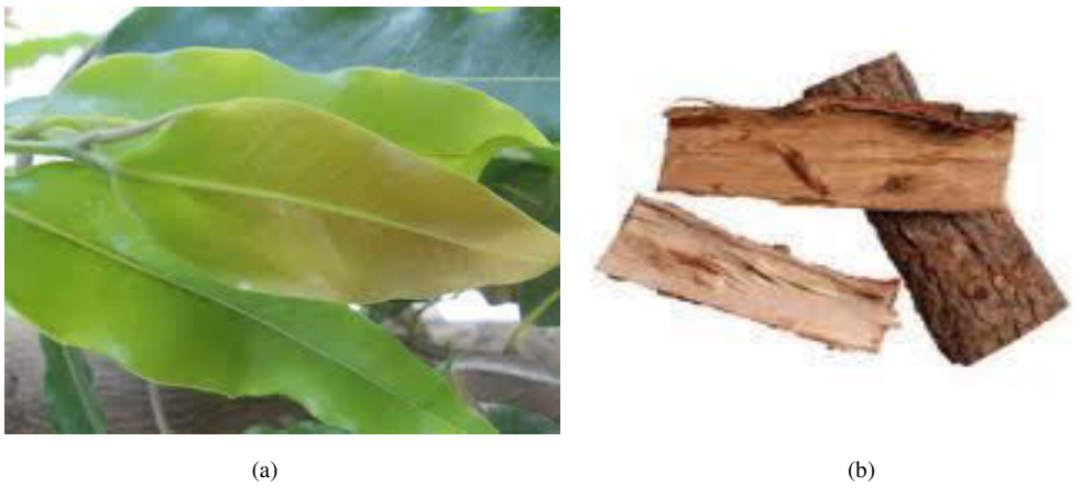
Fig. 1. Parts of plant Saraca indica (a) Leaf (b) Bark.

Leaves – It is a peripinnate, alternate, distichous and 7-30 cm long and its petiolule 0.1-0.6 cm long and opposite leaflets, 4-6 pairs, narrow elliptic-oblong or lanceolate, and its apex acute to acuminate, base acute to rounded or subcordate, glabrous, midrib raised above and tertiary nerves reticulate [1].